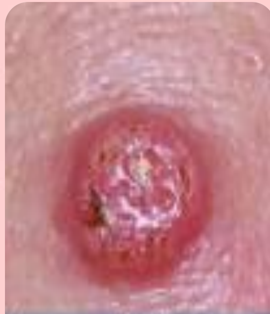
Squamous Cell Carcinoma